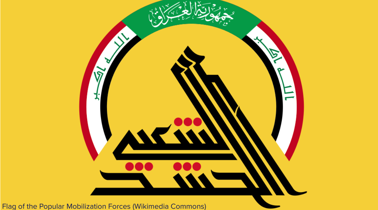
Flag of the Popular Mobilization Forces

stood a realistic chance of jeopardizing the PMF's lion share in Iraq's post-conflict economy, even in case its formal franchises in urban areas were to be closed indefinitely. 47