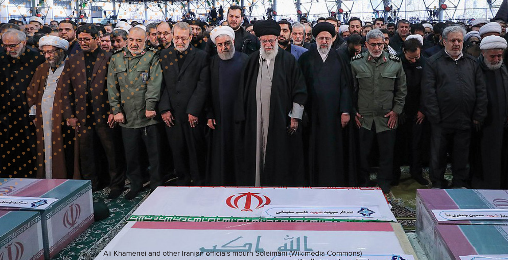
Ali Khamenei and other Iranian officials mourn Soleimani

and the Lebanon-based Hezbollah. 18 Without downplaying his longstanding relations with the IRGC and his friendship with Qasem Soleimani, Muhandis underlined that these ties and the mutual trust had evolved during an intense period spent as a regime dissident on Iranian soil: “I have lived in Iran for 20 years, how can I not have relationships? I was a military and political official in the Iraqi opposition, and I wanted to establish connections with different sides, but to think Iran works in Iraq through me is stupid.” 19 More importantly, Muhandis never ceased to frame his engagement with the Iran-backed pro-resistance factions as a conscious act of alliance-building, serving Iraqi national interests first, which he, in turn, defined and interpreted per his own cognitive biases. 20