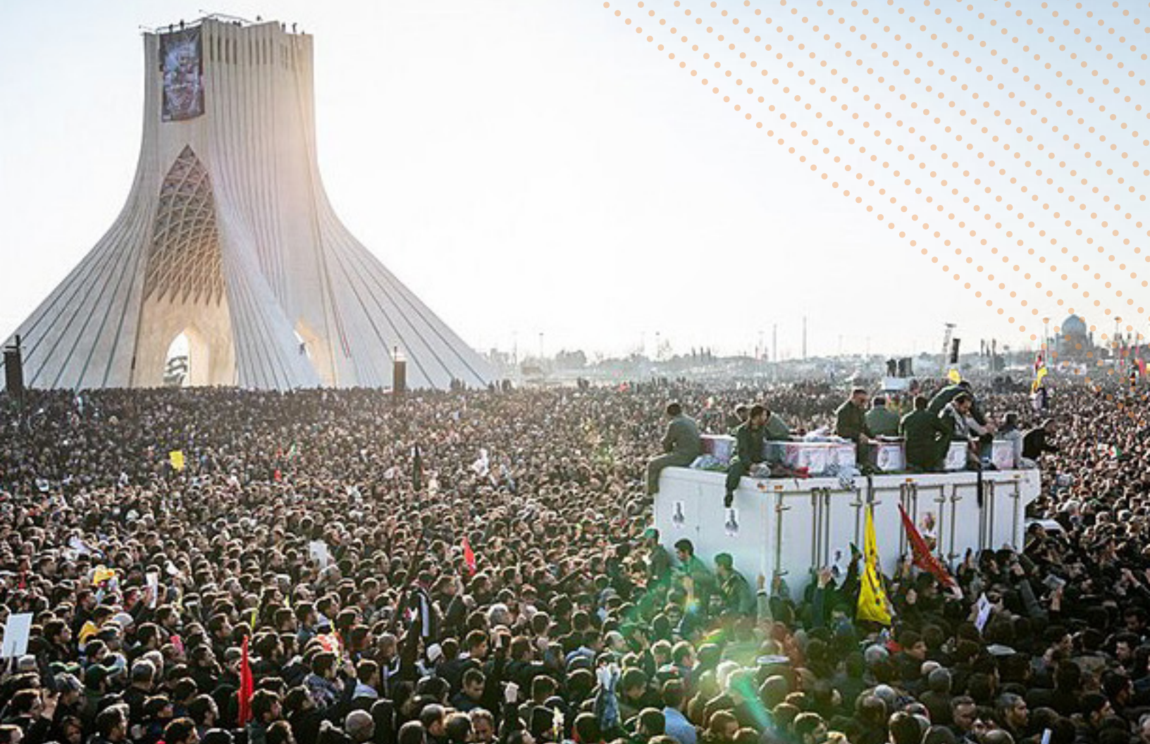
Mourners in Azadi Square, Tehran.

battle-hardened resistance factions, such as Kata'ib Hezbollah (Hezbollah Brigades), Badr, and their various outgrowths, still dominate key directorates under the cosmetically reformed command and control structure of the PMF. 11 Pursuing his reading of a Nash equilibrium (a competition wherein which no participant can gain by a unilateral change of strategy if the strategies of the others remain unchanged), Muhandis established a complex system of selective power redistribution. 12 Access to state funding and the veneer of legality that came with the institutionalization of the PMF incentivized these factions' commanders to