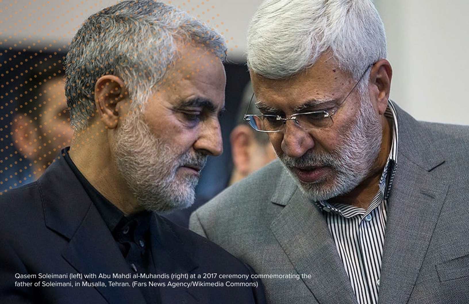
Qasem Soleimani (left) with Abu Mahdi al-Muhandis (right) at a 2017 ceremony commemorating the father of Soleimani, in Musalla, Tehran.