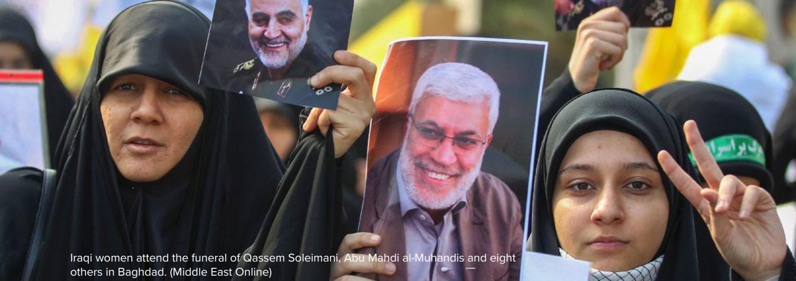
Iraqi women attend the funeral of Qassem Soleimani, Abu Mahdi al-Muhandis and eight others in Baghdad.

a lucrative entry point into the PMF parallel economy, access to funding, and a rubber-stamped mandate to defend their hyper-local interests and assets. Nevertheless, as pointed out by the former head of the Anbar Salvation Council Hamid al-Hais, the extent of institutional inclusion remained heavily dependent on those leaders' loyalty and did not entail veto powers. 24 And yet, the overall bonus package tied to a formalized PMF affiliation seemed attractive enough to brush off the shortcomings, as well as the implied reputational damage of being perceived as a Muhandis lackey—regardless of whether one was self-driven, bought off, or coerced.